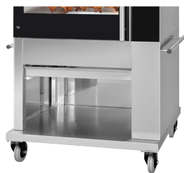
Matching stand on castors (optional)