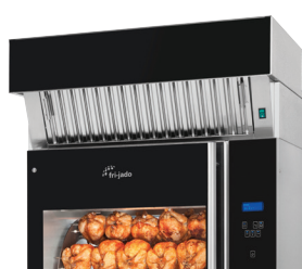
Ventless hood (optional)