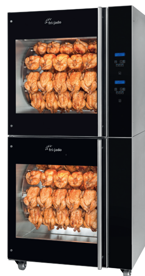
Also available: Stacked TDR 8 + 8 P