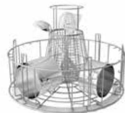
Saucepan support and ladle holder