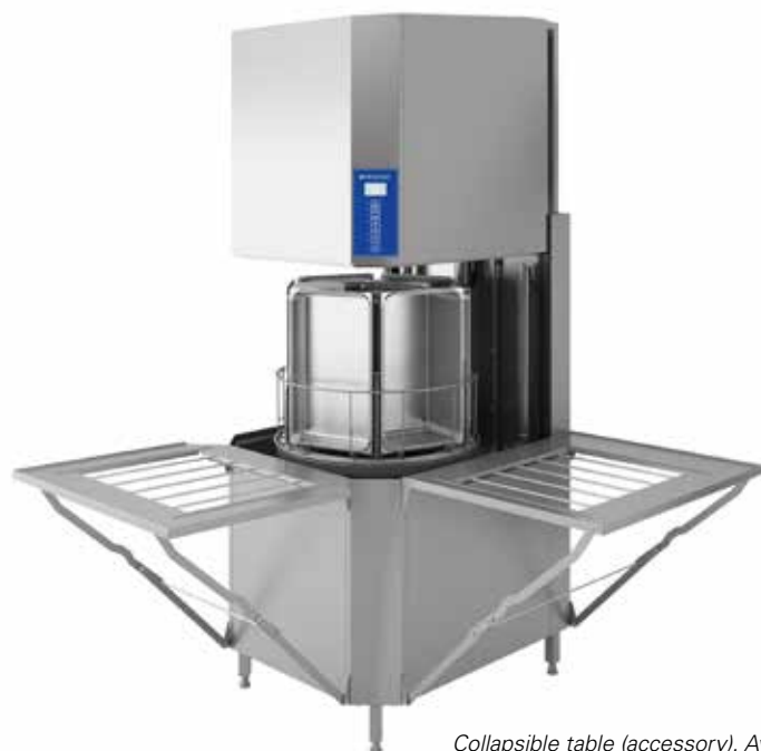
Collapsible table (accessory). Available for right, left and front installation.

One unique function offered by WD-90 DUO is spin cycles when potwashing. Dirty washing water is spun off before the rinse cycle, reducing the amount of clean rinsing water. Following the rinse cycle the dishes are spun a second time, which reduces the drying time.