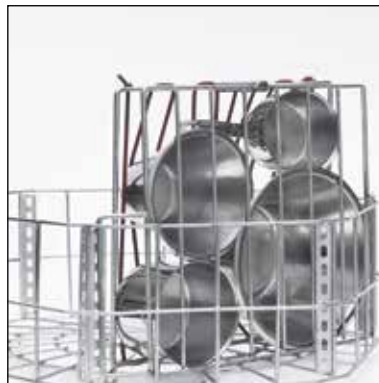
Flexible insert, part. no. 209.7283 Rubber rope holder for bowls and pots.