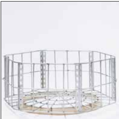
Hexagonal cassette, part. no. 209.7285 Included in the delivery.