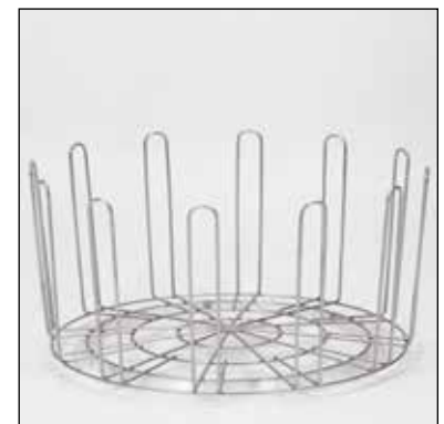
Basket for ABC containers, part. no. 209.7259

The following accessories are included as standard: