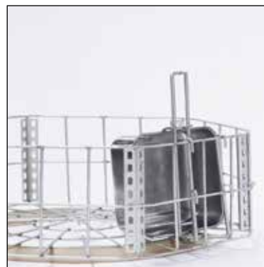
ABC- and lid holder, part. no. 209.7253