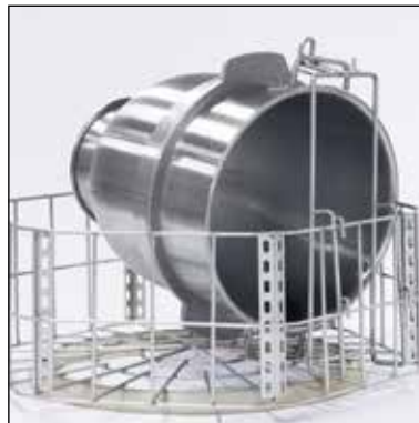
Pot holder, part.no. 209.7255 For large pots. Included in the delivery.