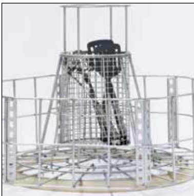
Utensil holder, part. no. 209.7251 For hexagonal cassette and round basket.