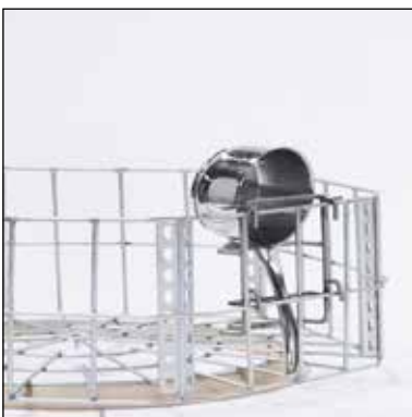
Pot holder, part. no 209.7268 For frying plates and pots.