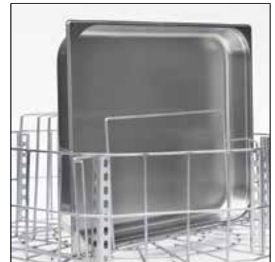
Grid, part. no. 209.7284 For 2/1 containers, grids, baking plates. Included in the delivery.