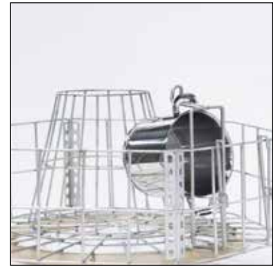
Pot holder for small pots, part. no. 209.7254